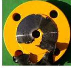
3. Remove CK-656 CK-656 is removed after complete hardening of paint.