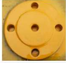
2. Painting Apply paint after 4 hours.