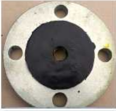
1. Apply CK-656 Apply using a brush (black)

☑ Application method (Industrial: Used as protection for surface of flange, removed when necessary, to reduce cost and improve productivity)