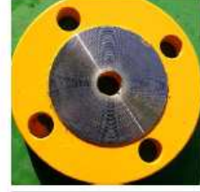
4. Check surface The surface is in good condition.